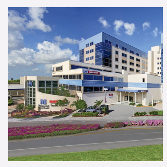
Memorial Regional Hospital 3501 Johnson St. Hollywood, FL 33021